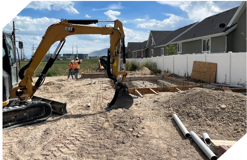
SHELTER #4 CONCRETE SLAB AND FOUNDATION

Network have subscribed for service within the first two months. There are currently 85 residents who have completed the sign up process in cabinet area 5 .