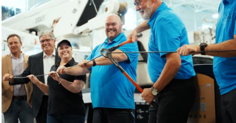
Figure 2 – Lehi City Fiber Cutting Ceremony

The marketing team also worked with V6 to provide a recap video of the fiber cutting ceremony. The ceremony took place on September 6, 2022 and celebrated the partnership between STRATA and Lehi City: https://www.youtube.com/watch?v=Oq3azIAaUW0 .