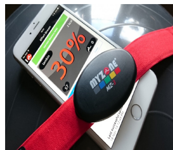
Belt may be used in and out of the facility!

LEHI LEGACY CENTER 123 North Center Street 385.201.2000 www.lehi-ut.gov/legacy-center