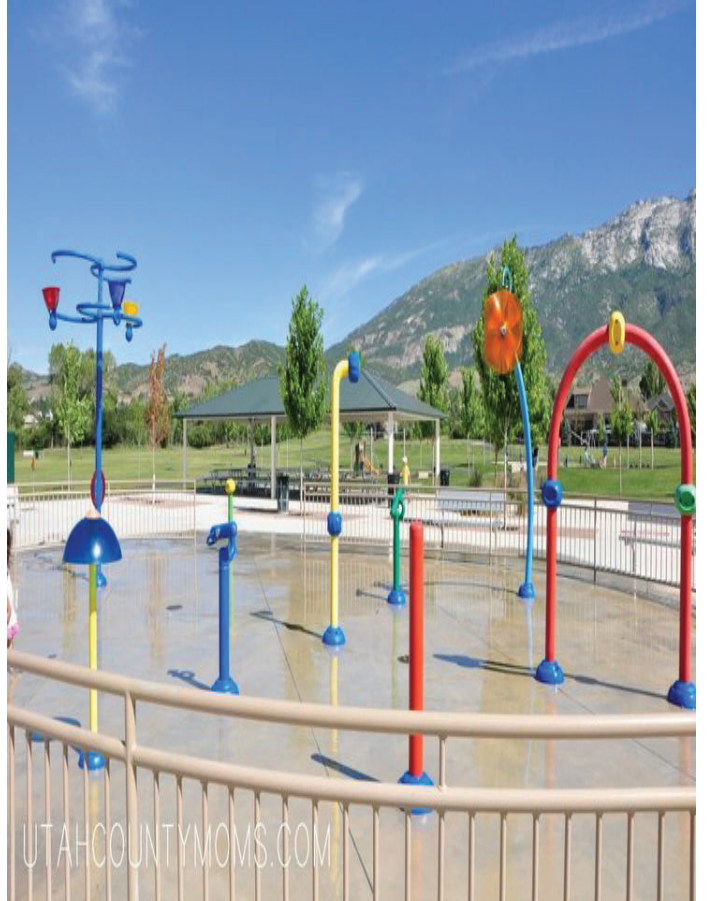
Splash Pad in Alpine, UT