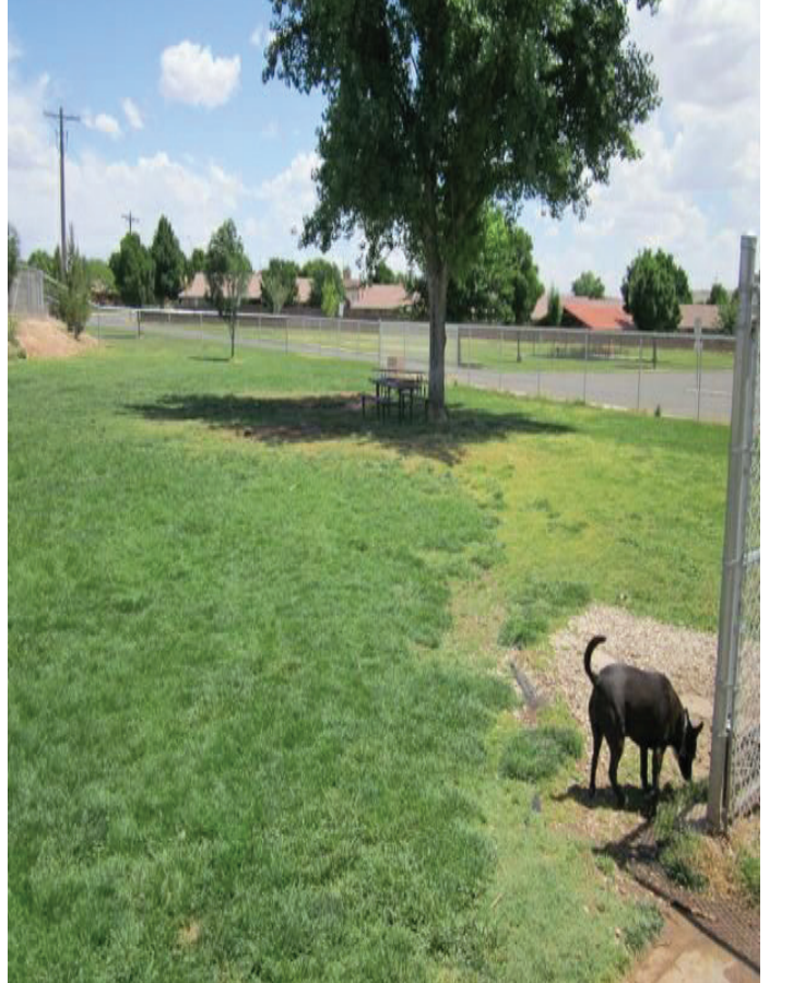
Fenced Dog Park in St. George, UT