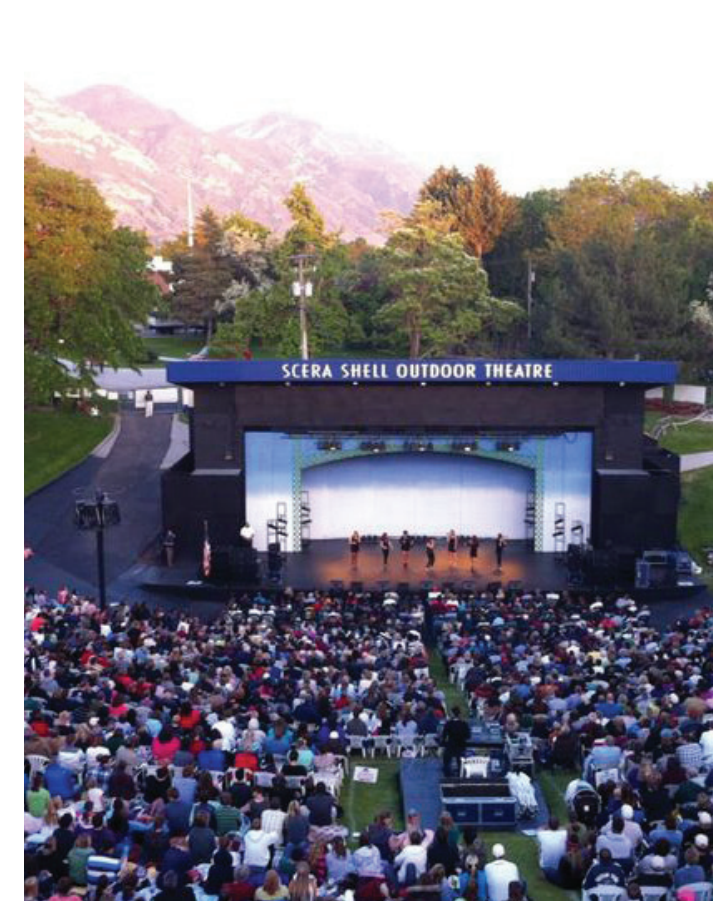
Scera Outdoor Theatre in Orem, UT