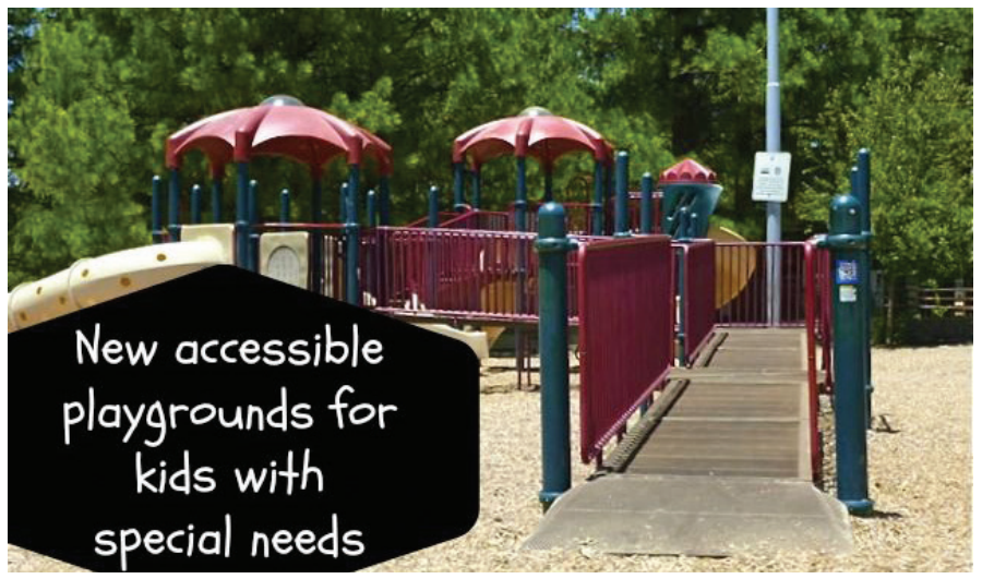
Wheelchair Accessible Playground

We are still looking for ideas! To continue to gather feedback, Lehi City has created a Pinterest account where residents can post pictures of amenities they would like to see in a new park. Just follow us on Pinterest at www.pinterest.com/lehicityut/peck-park-design-workshop . Below are some pictures people have already pinned on our Peck Park board.