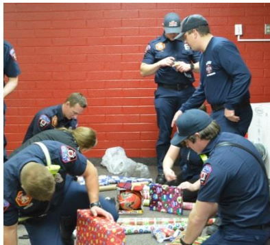
Lehi firefighters wrapping presents

The program has been running for at least eight years. Each year the department selects three to four families who they personally know that need aid. The "Sub for Santa" program is not possible without the generous support of local businesses as well as individuals. Some of the sponsors include Broadbent's Store, Rock Canyon Pharmacy, Wal-Mart, Big 5, Target, and Best Buy. The Local Union 4862 also contributes, as well as the Lehi Fireman's Association, which is funded by the firefighters themselves.