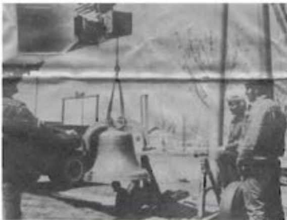
Figure 49 The original fire bell being hoisted into place

Turner who acquired it when he bought the old Pioneer building on Main Street. The bell was more than 100 years old. The bell is being lifted onto the frame work that was prepared for it in picture # 49. Picture #50 shows it hanging in front of the old station. It currently