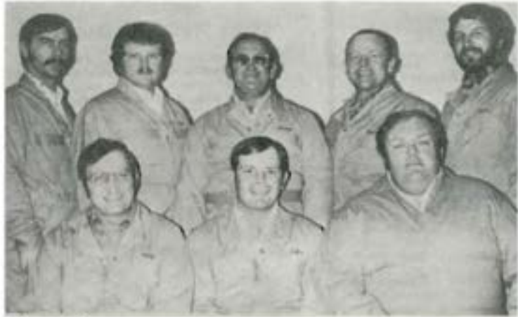
Figure 62 Lehi Fire Department Officers for 1978