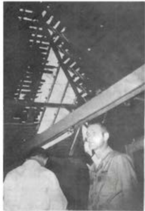
Figure 51 Fire at Saratoga

Firemen in figure 51 inspect the damage to the arcade storage building at Saratoga, May 9. The building and contents sustained $1,500 damage. The cause of the fire is unknown. An editorial in the May 9, Lehi Free Press said that this may be the last year for Fireworks on the Fourth of July . The costs have increased every year. An evening of fireworks was about $175.00. Now the cost is nearly $1,000.