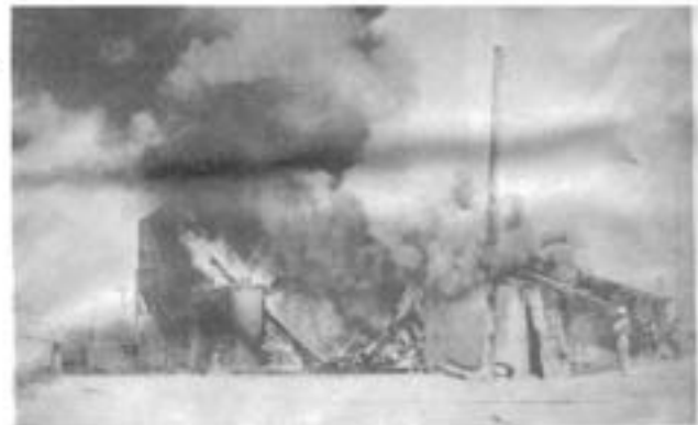
Figure 55 Shed fire at the Ken Webb residence

The fire was brought under control in one hour. Four pieces of equipment and 20 men responded to fight the fire. Figure 55.