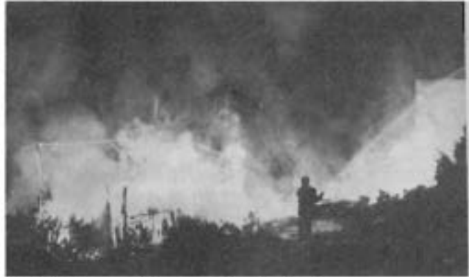
Figure 48 Dairy barn fire at Nuttalls