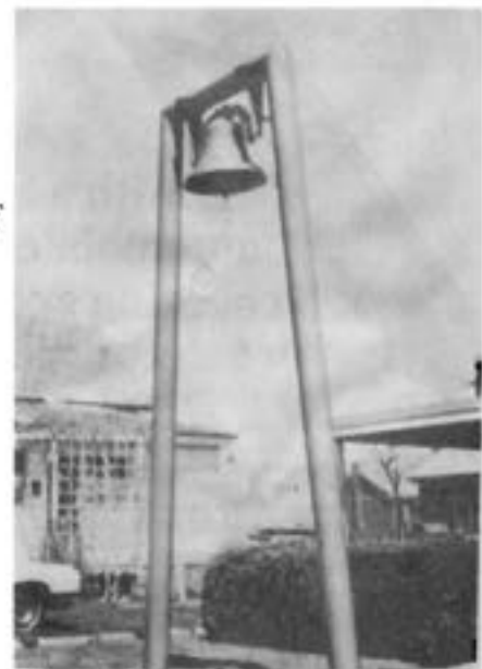
Figure 50 Lehi fire bell

hangs in front of the new fire station at 176 North Center.