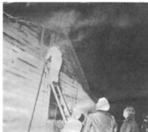
Figure 45 Fireman inspects the attic

Firemen were stretched thin when they responded to three fires in high winds. The first was a grass fire at the Jordan Pumps. The second was a hay fire at the Joe Colledge farm where twenty tons of hay were destroyed and fifteen to twenty tons were saved. The cause of the fire was a branding fire left for dead rekindled in the wind.