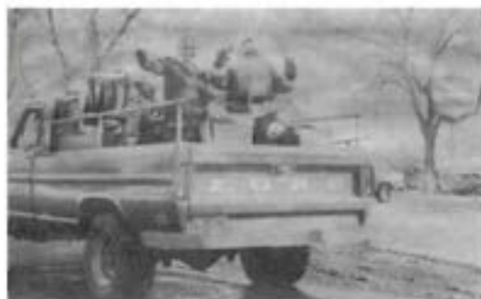
Figure 56 Santa and Mrs. Claus

Mr. and Mrs. Santa Claus wave to the crowds on a wet and cold Saturday afternoon. The Clauses used Lehi's brush truck for their