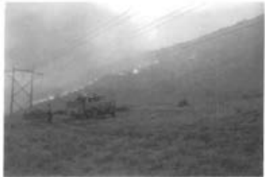
Figure 60 Brush fire above Alpine

It is more dangerous to live in the county than in Lehi reports the February 24, 1977 Lehi Free Press . Lehi City had an increase of one fire in 1976 over 1975. The county more than doubled its fires. In 1975 there were 31 fires compared to 70 fires in 1976. Mostly grass fires. Chief Grant Smith stated that there had been three suspicious grass fires near the Lehi Roller Mills in the past two weeks. Arson was suspected.