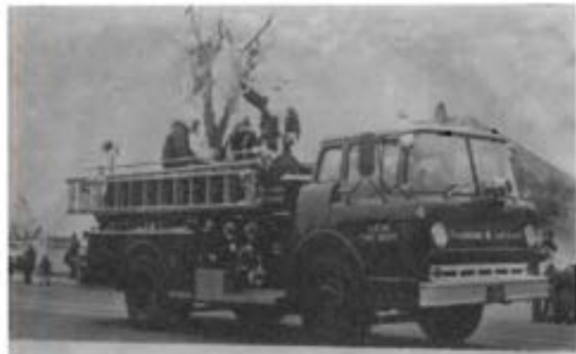
Figure 47 Santa Claus ushers in Christmas