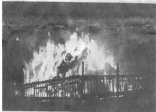
Figure 53 Fire at the Neil Oldhams property

The Lehi Volunteer Fire Department answered 105 calls for 1974 with a damage estimate of $121,295. They responded to 52 grass fires, eleven vehicle fires, nine house and several shed fires. Seventeen of the calls were false alarms and there were sixteen miscellaneous calls.