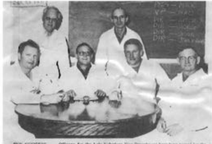
Figure 44 Officers of the Lehi Fire Department for 1972

The fire department was called out Sunday morning December 23, to the Mahlon Peck dairy farm. The roof of the dairy barn and granary had burned off before the department arrived. Cause of the fire was a faulty heater in the milk barn. There was a heavy fog that had settled over the area which hid the fire for some time. It lifted just in time for a neighbor, Jerry Brooks to see the flames and call the fire department.