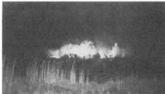
Figure 64 Grass fire in north Lehi

Grass fires continued to plague the fire department. This one, North of town, was extinguished as it was threatening homes in the area. Approximately 20 acres was burned. Kids and matches were suspected. Figure 64.