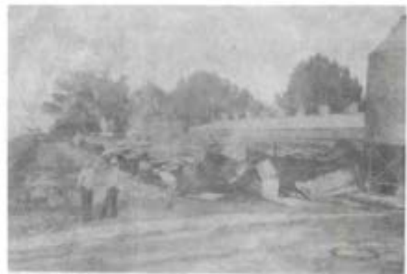
Figure 61 Fire at Sage Hill egg farm

An early morning blaze destroyed one chicken coop containing 26,000 laying hens. The alarm came in at 2:35 a.m. The fire department sent five trucks and 25 men. Damage estimates were more than $150,000. This was the second fire at the Sage Hills egg farm. Firemen fought a similar fire in 1967. Figure 61.