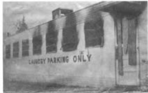
Figure 54 Powell's Laundry

Lehi Police Officer Lonnie Hardy discovered the blaze while on patrol. Damage estimates were between $35,000 and $40,000. The boiler room was the cause of the fire. Figure 54.