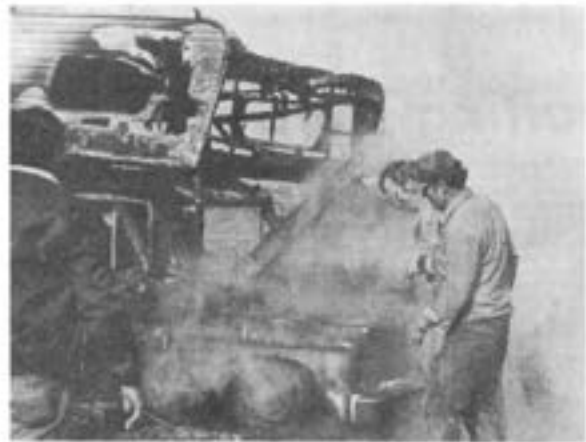
Figure 63 Truck and camper fire

Firemen were taught how to remove the wreckage from the victim and not the victim from the wreckage. Spinal immobilization was also taught. Lehi firemen Grant Smith and Ned Wilson inspect the cause of the fire that destroyed this truck and camper. A suspected gas leak was the cause of the fire. The fire occurred as the family was on their way to Delta for the Holidays. Figure 63.