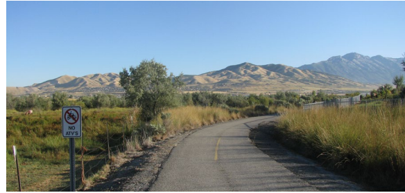
Figure 1. Jordan River Parkway Trail.

The Jordan River Protection Overlay Zone applies to all parcels or properties located within the Jordan River Buffer Area as identified on the Lehi City General Plan Land Use Map.