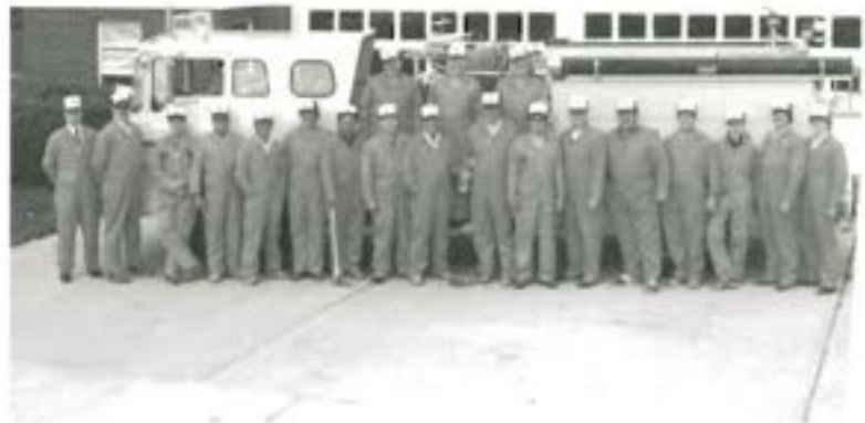
Figure 71 Member of the Lehi Fire Department in 1980