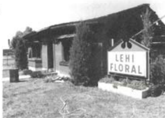
Figure 69 Two fires in one night destroyed the Lehi Floral

The Lehi Floral was destroyed by fire on July 15, 1979. The first fire started in the early evening and was put out by Lehi firemen. The investigation was on going when the fire department was called back at approximately 3:00 a.m.. The building was totally engulfed in flames on their arrival. Lehi Firemen extinguished the fire and continued with the investigation. Arson was suspected in both fires. Figure 69.