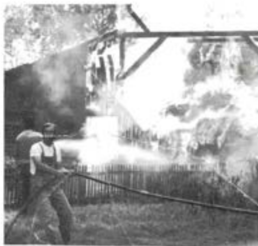
Figure 68 Cox fire at 300 West 300 South

A barn and hay stack were destroyed in this fire at the Cox residence 300 West and 300 South. A fireman drags a hose to help extinguish the fire. Arson was suspected. Figure 68.