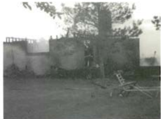
Figure 78 Fitzgerald house fire

On May 7, 1986, a house owned by Fitzgerald's at 1125 North Cedar Hollow Road was destroyed by fire during the night. The call came in at 3:45 a.m. High winds and lack of water hampered the efforts of the firemen in trying to extinguish the fire. The fire started near the dryer due to an accumulation of lint.