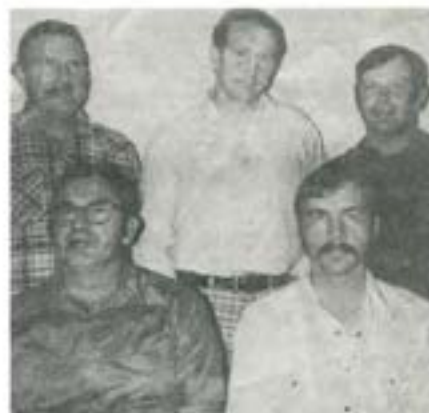
Figure 67 Officers for 1979