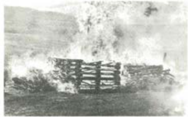
Figure 75 Building material fire

owner was burning off some dead grass when the wind came up and blew into a pile of building material valued at $1,500. Figure 75.