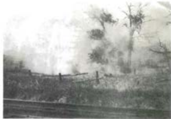
Figure 77 Grass fire in south Lehi

Firemen responded to this fire south of Lehi. The fire burned 5 acres before it was controlled. Authorities suspect it was arson. Figure 77. The fire department began to respond to a number of arson fires involving grass and brush along Redwood Road and the Lake Mountains.