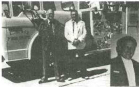
Figure 74 Firemen receive honors

In June, 1980 three members of the Lehi Fire Department were honored by the Utah State