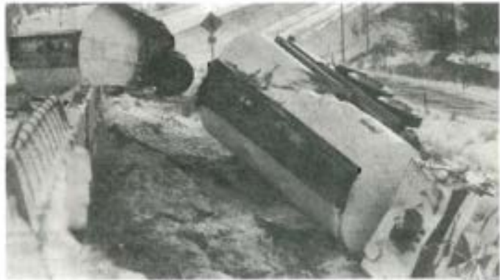
Figure 72 Tanker truck rollover

The Lehi Fire Department responded to a fuel truck rollover that killed the driver. The truck lost control on icy roads and overturned spilling more than half of the 9,500 gallons of gasoline. "Lehi fire crews did an outstanding job keeping the gas from igniting" stated one official. The crews used foam to cover and dilute the gas to keep it from igniting. Firemen