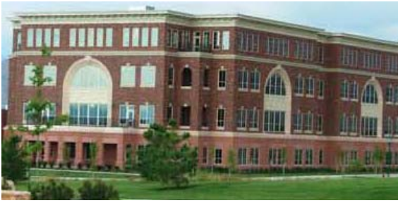
Figure 2. Vertical separation between stories has been established by a change in building materials and architectural style.

E. Building entrances should be located at intervals of no more than seventy-five (75) feet along any elevation facing a street. If building entrances are located more than seventy-five (75) feet apart, or if there is a single entrance point on a façade greater than one hundred fifty (150) feet in length, the areas between the entrances shall utilize shaded sidewalks, awnings, windows, or other similar pedestrian-friendly architectural features, unless otherwise approved by the Planning Commission. (see Figure 3)