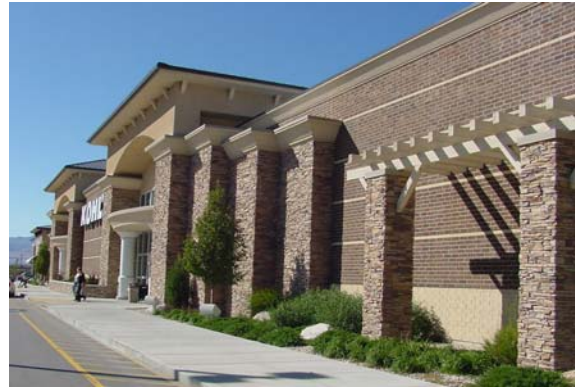
Figure 4. Building is constructed of rock and brick, with stucco accents.

F. All buildings shall be constructed of the following building materials: brick, stone, earth-tone colored decorative block, fiber/cement siding, wood, glass, or other durable building material as approved by the Planning Commission. Exterior building materials shall be limited to no more than three types of materials per building. Stucco, metal, or untreated concrete block (CMU) may be allowed by the Planning Commission as an accent only. Metal clad buildings, or large sections of stucco or vinyl siding are prohibited unless otherwise approved by the Planning Commission. (see Figure 4)