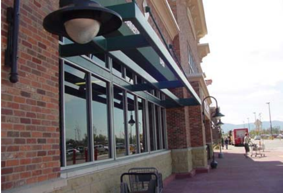
Figure 3. Area between building entrances is treated with awning and windows to create a pedestrian friendly environment.

E. Building entrances should be located at intervals of no more than seventy-five (75) feet along any elevation facing a street. If building entrances are located more than seventy-five (75) feet apart, or if there is a single entrance point on a façade greater than one hundred fifty (150) feet in length, the areas between the entrances shall utilize shaded sidewalks, awnings, windows, or other similar pedestrian-friendly architectural features, unless otherwise approved by the Planning Commission. (see Figure 3)