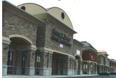
Figure 1. Visual interest is created through variation in building projections and construction materials.

C. Commercial buildings shall be designed with architectural wall variations spaced at intervals of thirty (30) to fifty (50) feet in linear width, depending on the size of the project. This shall be achieved through a change in building materials, building projections, relief measuring at least three (3) feet in depth, or another architectural variation that creates visual interest. (see Figure 1)