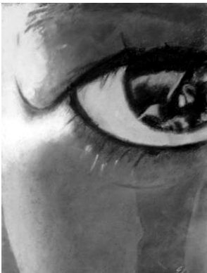
Above: On the Beach , Pamela M. Poulsen, 2 nd Place 2007, Adult Division; Intangible Heart , Elan Monson, 1 st Place 2007, Youth division Front: Figure Study with Hand , Casey Childs, 1 st Place 2007, Adult Division